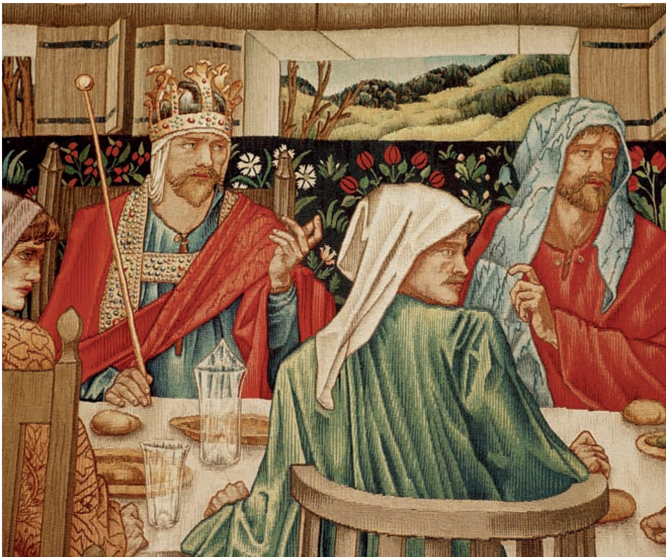
Detail of The Holy Grail Appears to the Knights of the Round Table (1927–1932), by Morris & Company, Merton Abbey Tapestry Works, after design about 1891 by Edward Burne-Jones. 250 cm × 530 cm. Münchner Stadtmuseum, Munich.

25 breastplate or gorget (gôr'jĭt) or iron cleats : armor for the chest, the throat, or the shoulders and elbows.