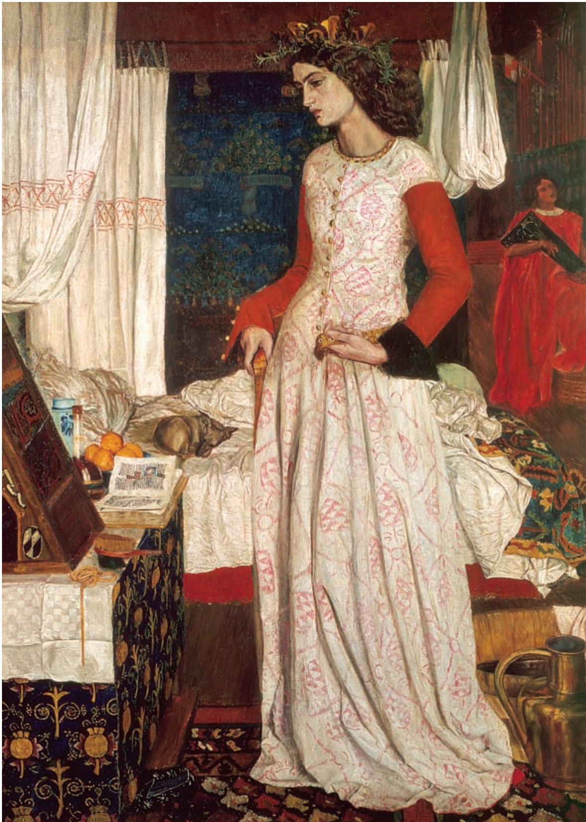
Queen Guinevere (1858), William Morris. Oil on canvas.